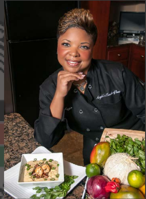
Angela's Touch of Class Catering